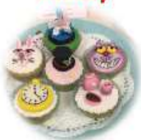
Be in it to win it!